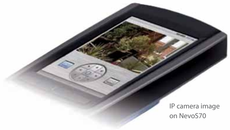
IP camera image on NevoS70